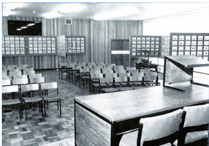
The Library Lecture Hall 1975